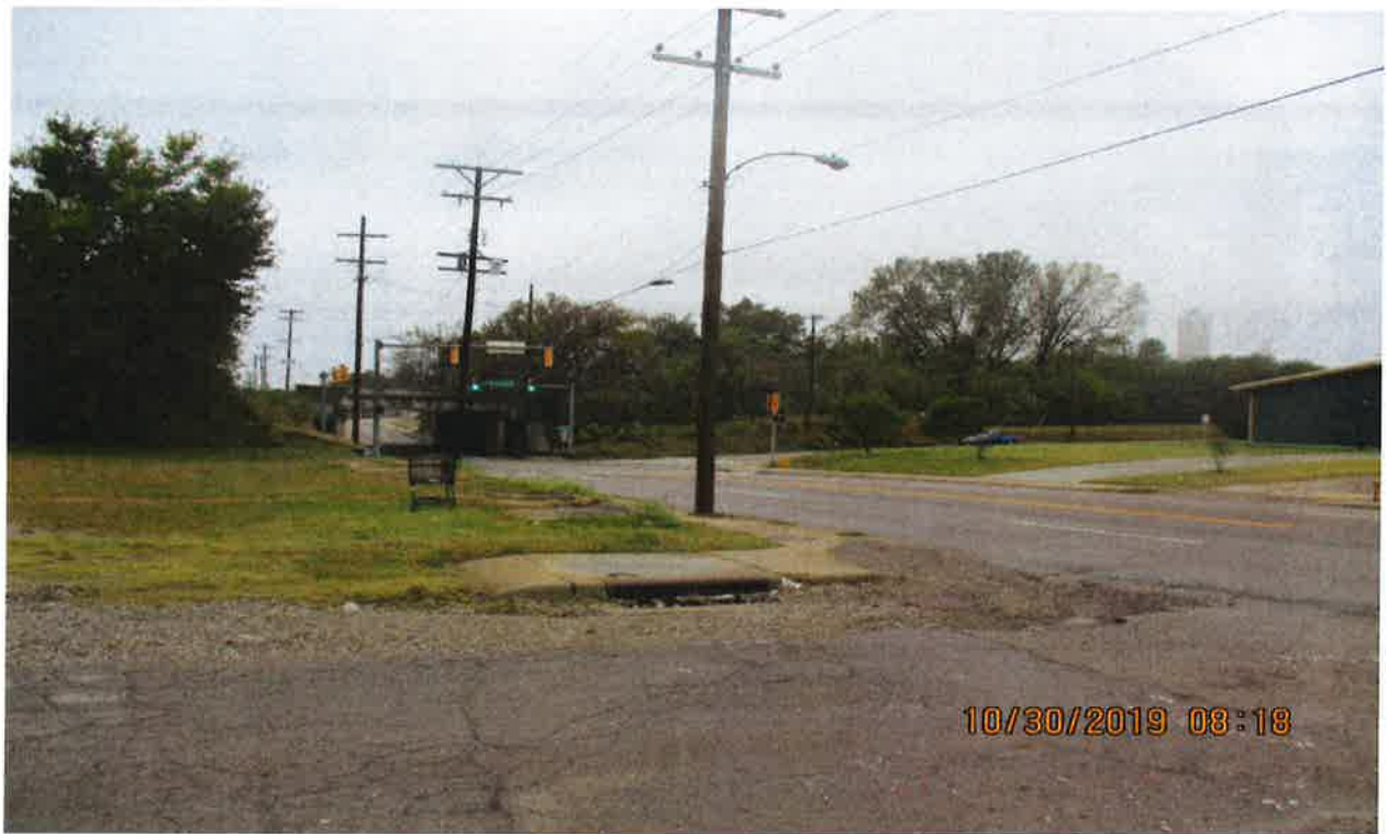
Facing South on Peoria