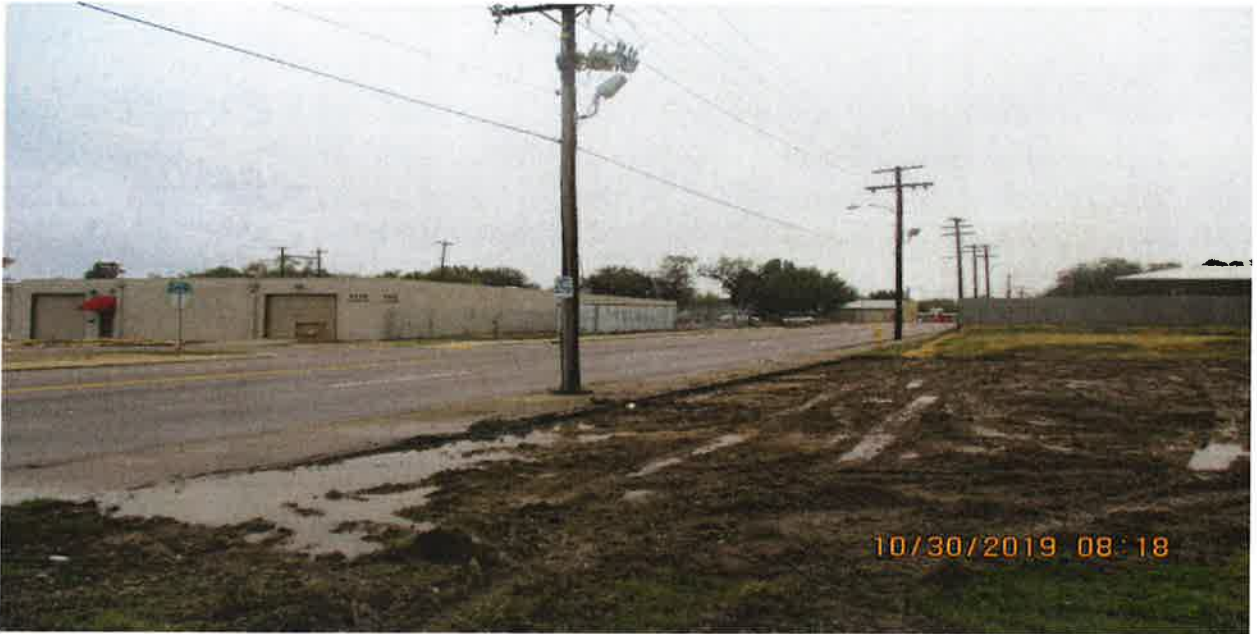
Facing North on Peoria