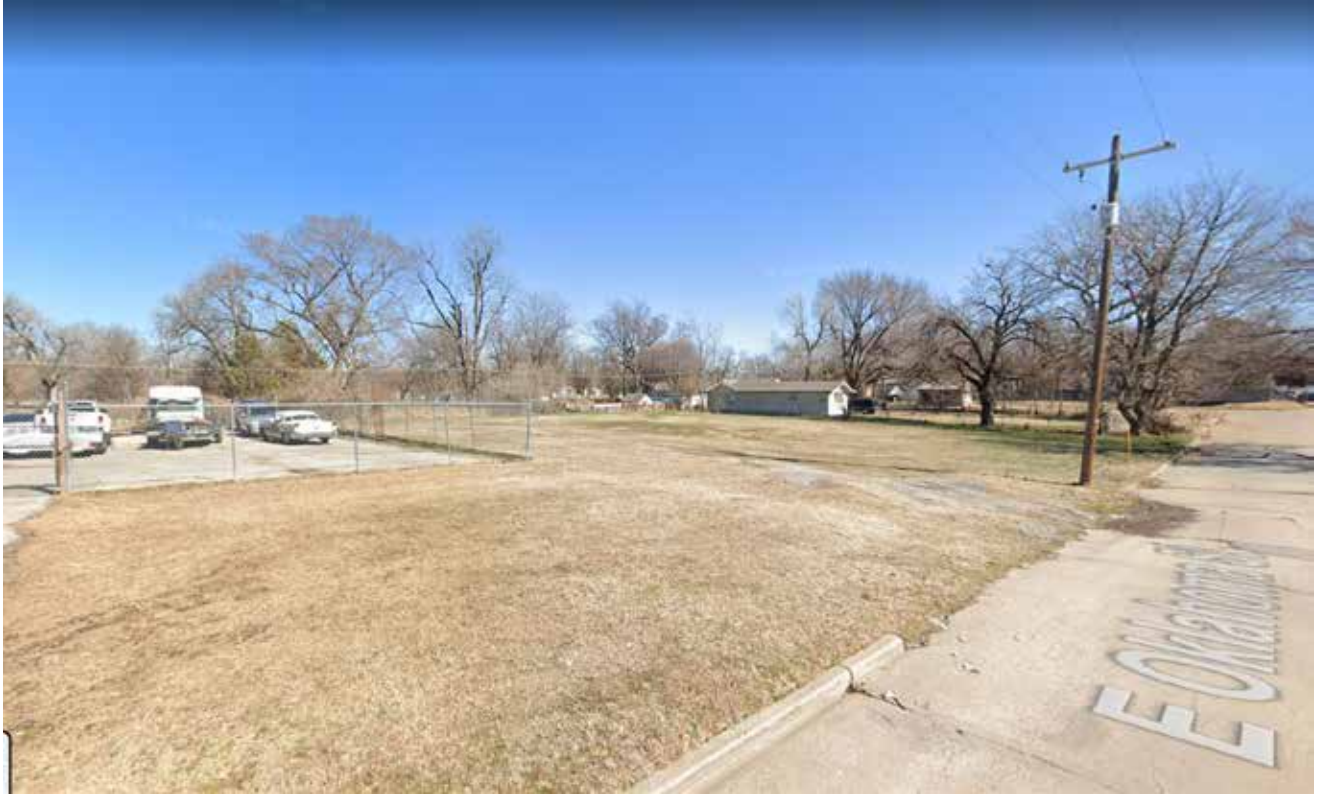
STREET VIEW FROM NORTHWEST LOOKING SOUTHEAST