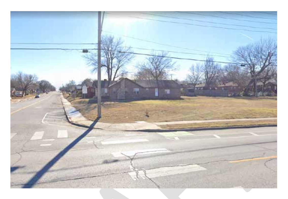
Environmental Considerations: None that would affect site development.