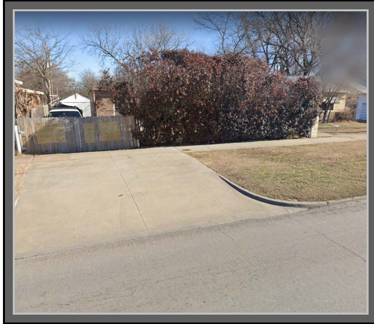
(Image taken from google.com street view. Capture date: January 2023)

Staff Summary: Property is currently a vacant single-family residential lot occupied by a vacant detached house and two accessory buildings.