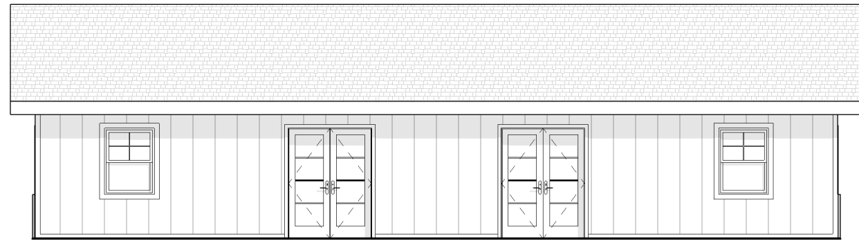
3 REAR ELEVATION