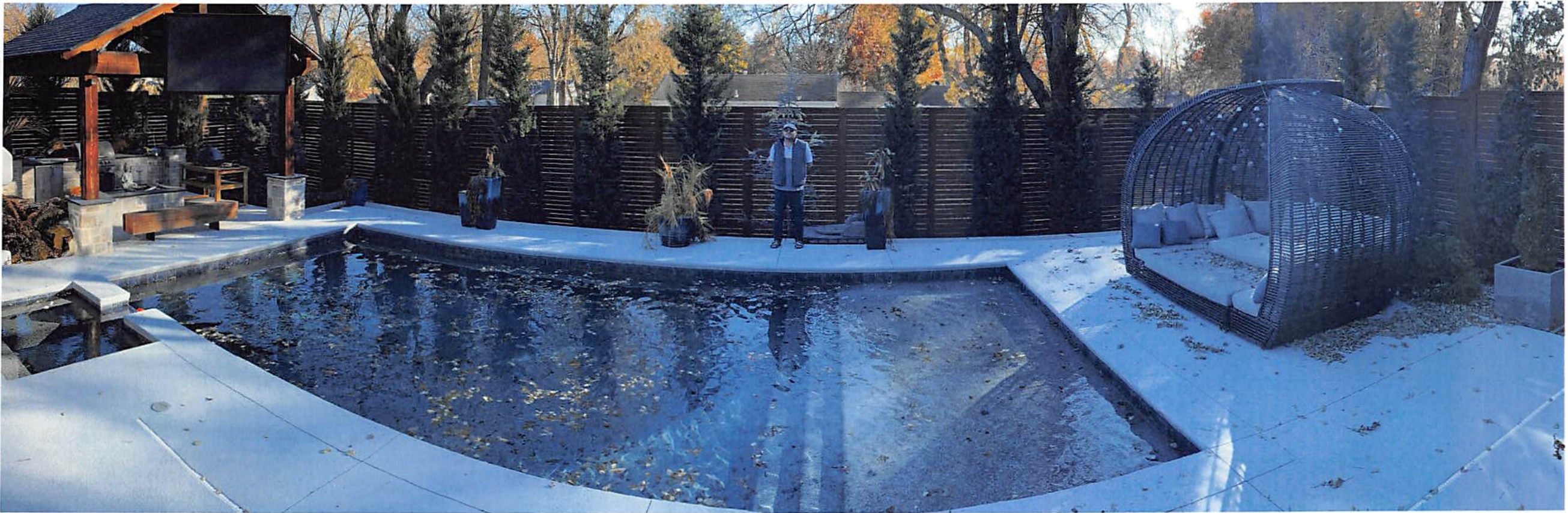
Case No. BOA-23174 2552 E. 16 th Street Panorama of backyard facing south