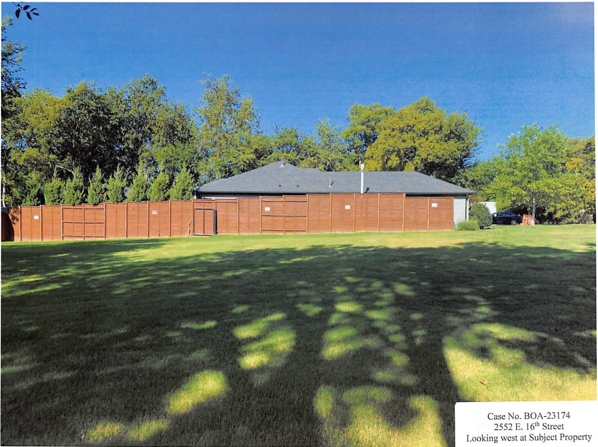
Case No. BOA-23174 2552 E. 16 th Street Looking west at Subject Property