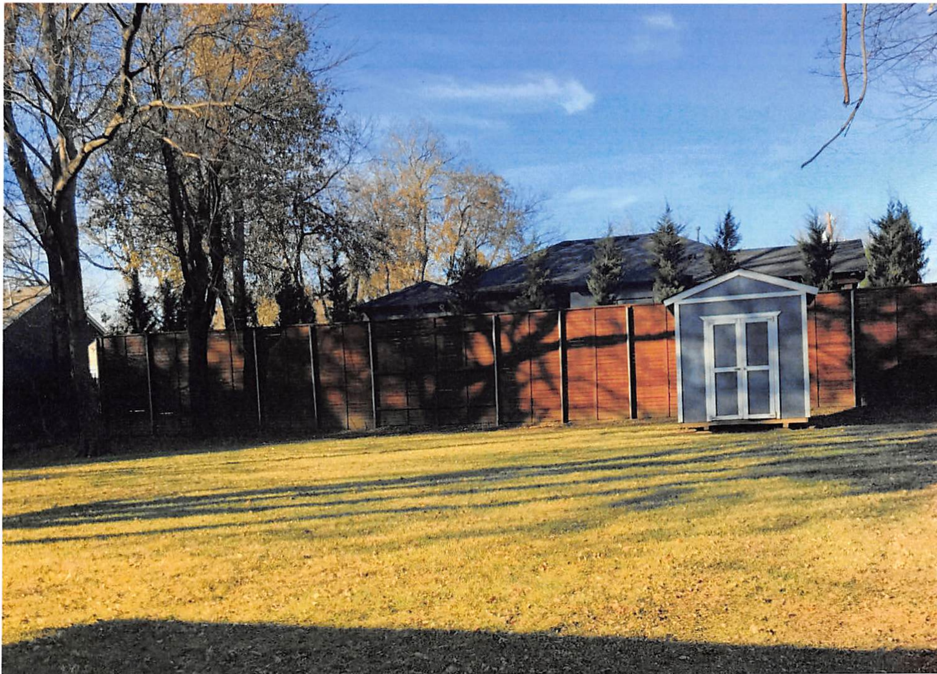
Case No. BOA-23174 2552 E. 16 th Street View of backyard from adjacent property to the south