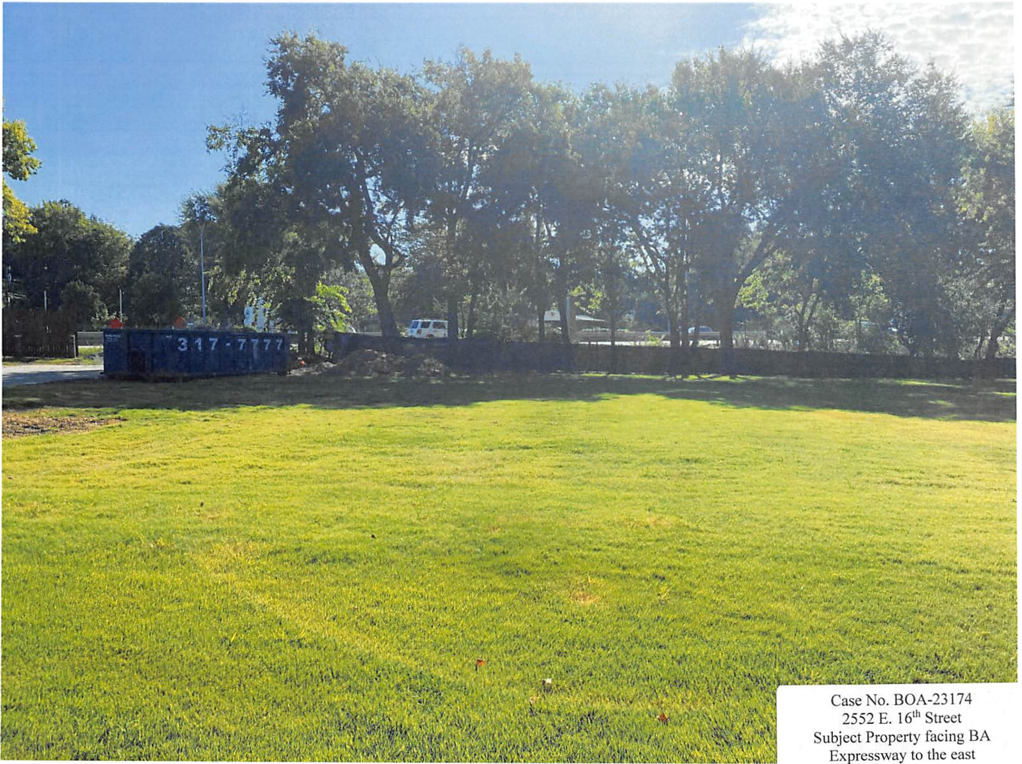
Case No. BOA-23174 2552 E. 16 th Street Subject Property facing BA Expressway to the east