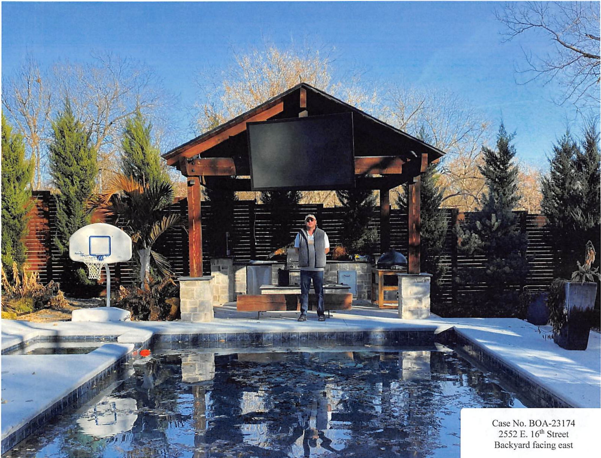
Case No. BOA-23174 2552 E. 16 th Street Backyard facing east