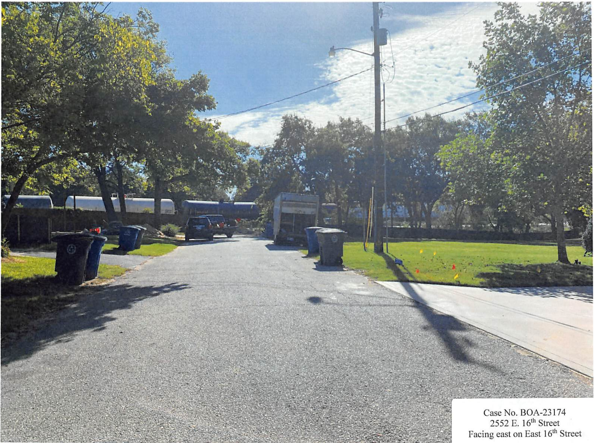
Case No. BOA-23174 2552 E. 16 th Street Facing east on East 16 th Street