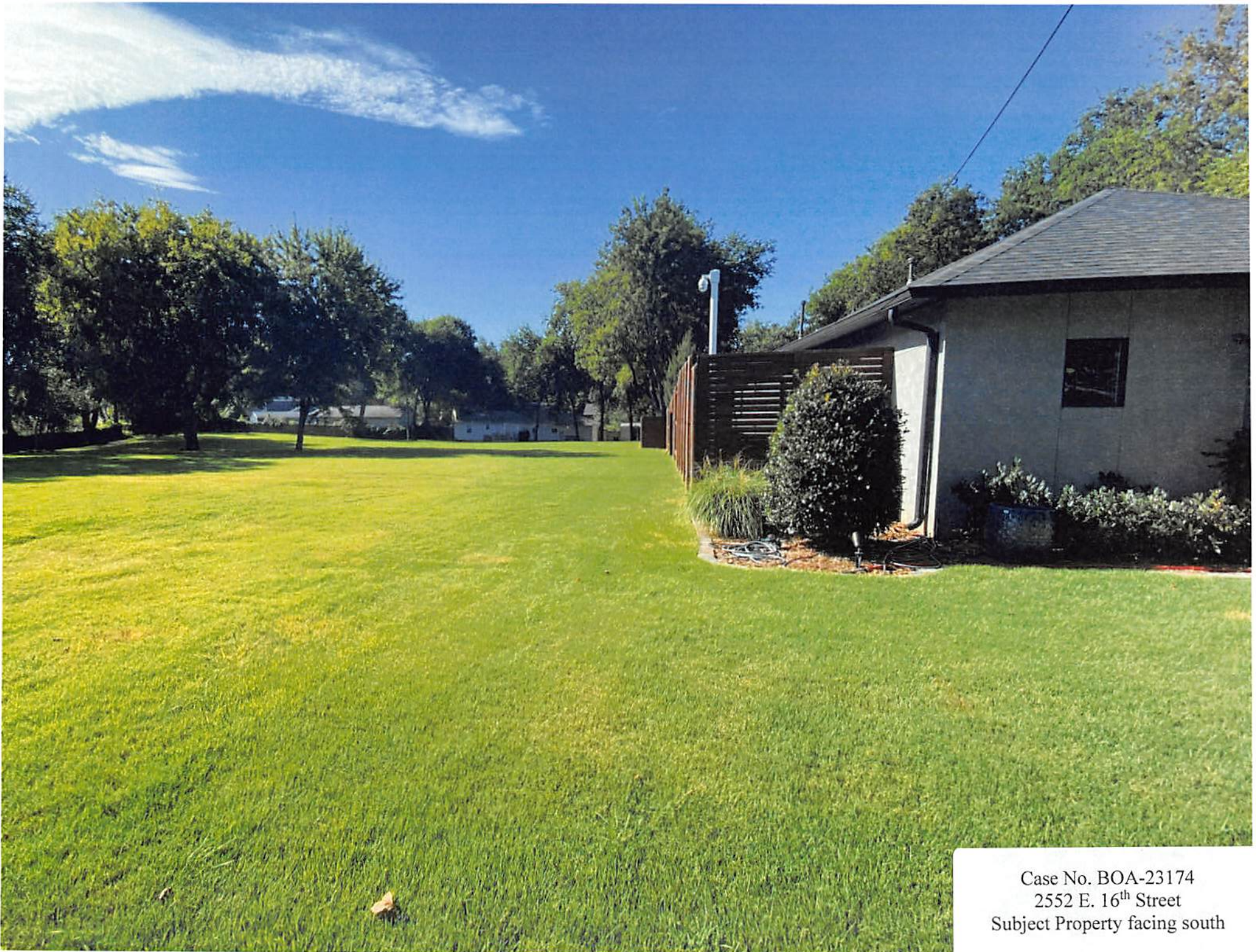
Case No. BOA-23174 2552 E. 16 th Street Subject Property facing south