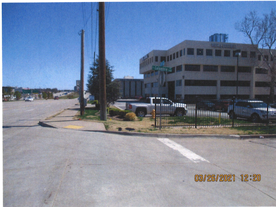
Facing East on 51 st Street