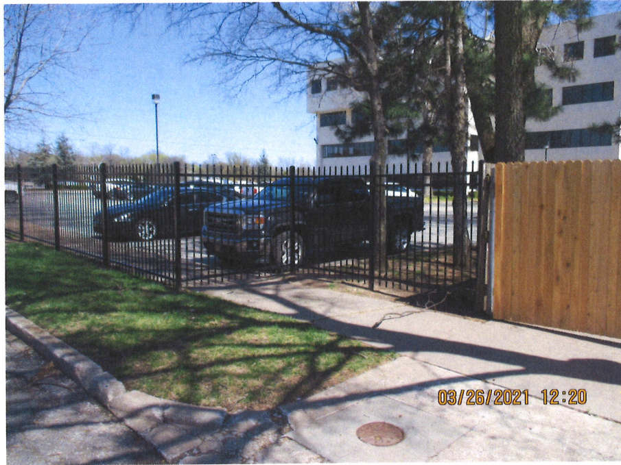
Fence along S. Columbia