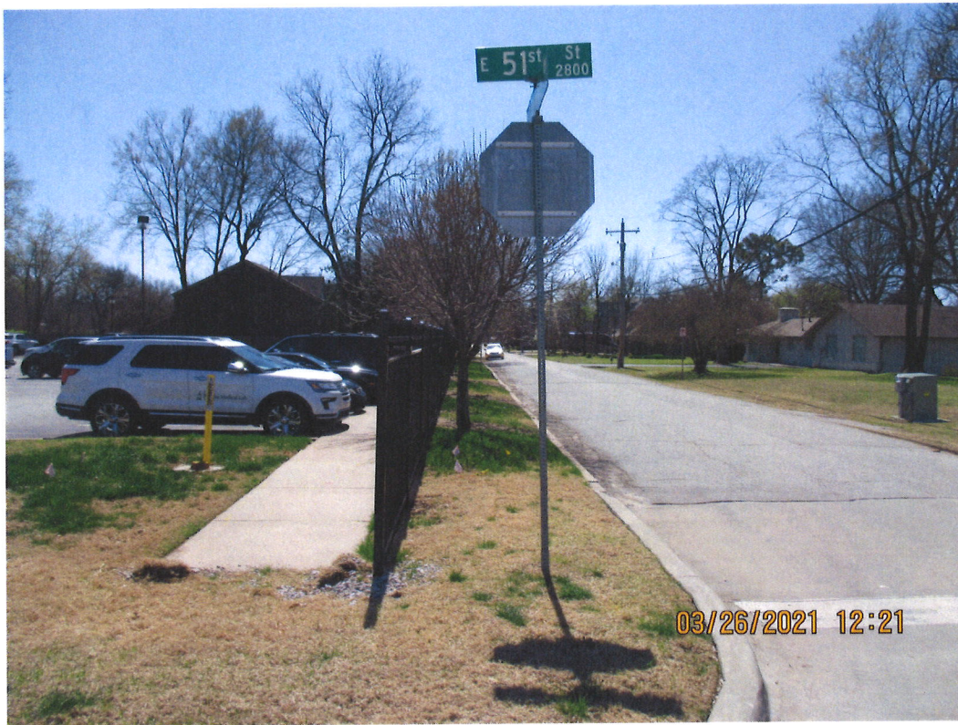
Facing South on Columbia