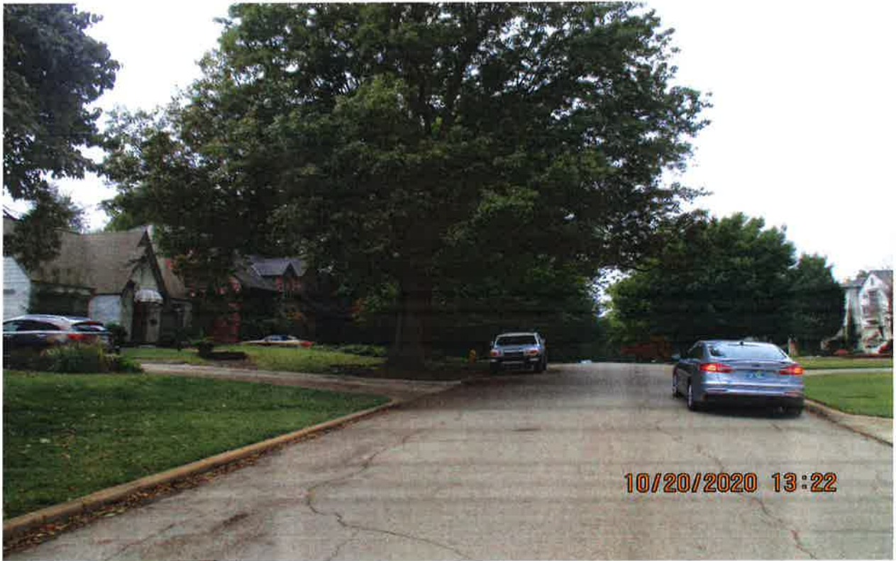
Facing West on 27 th St.