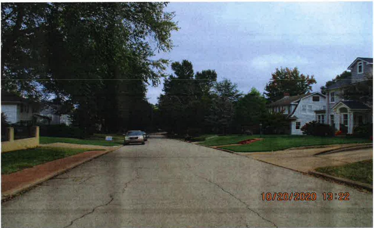
Facing East on 27 th St