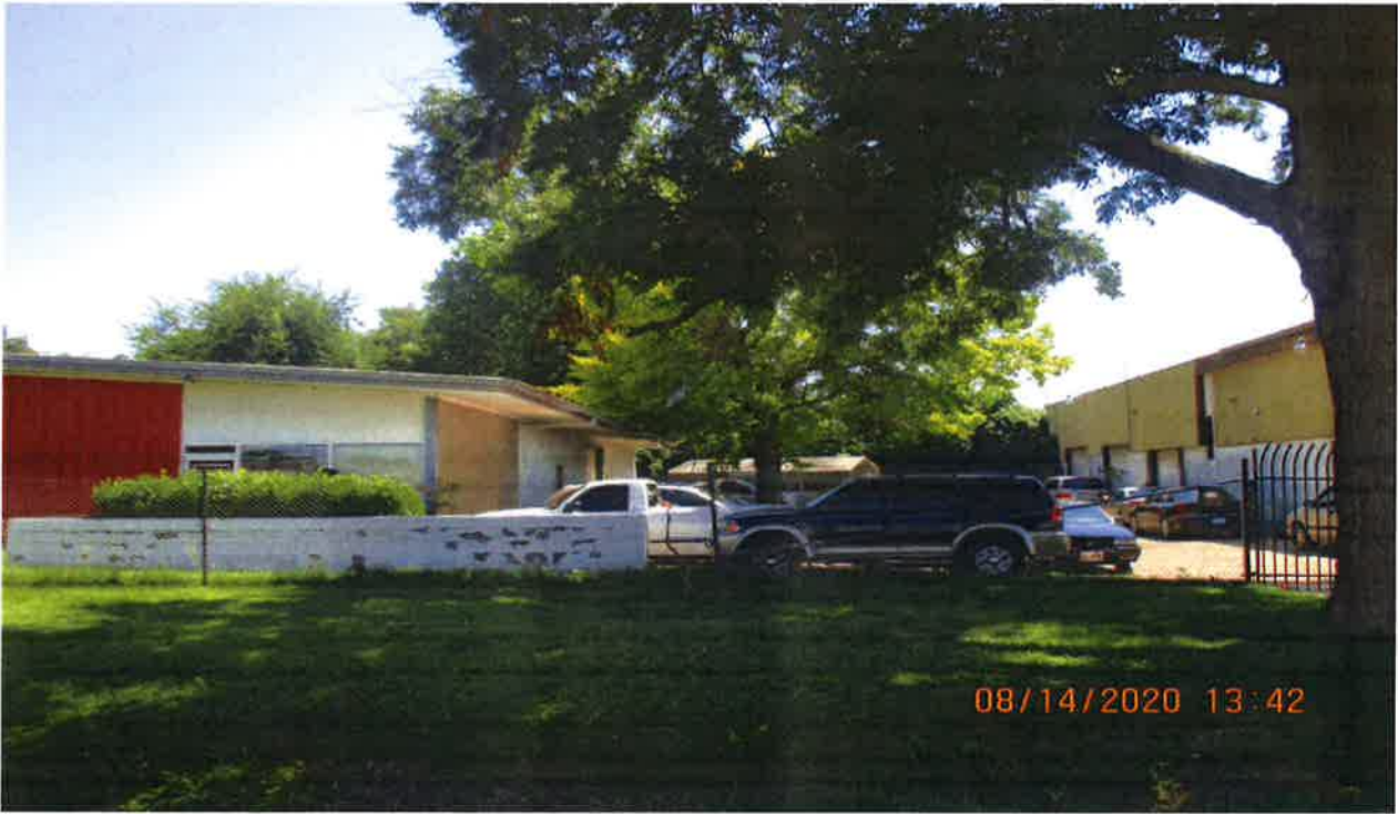
Subject property (1320 E. 58 th St.)