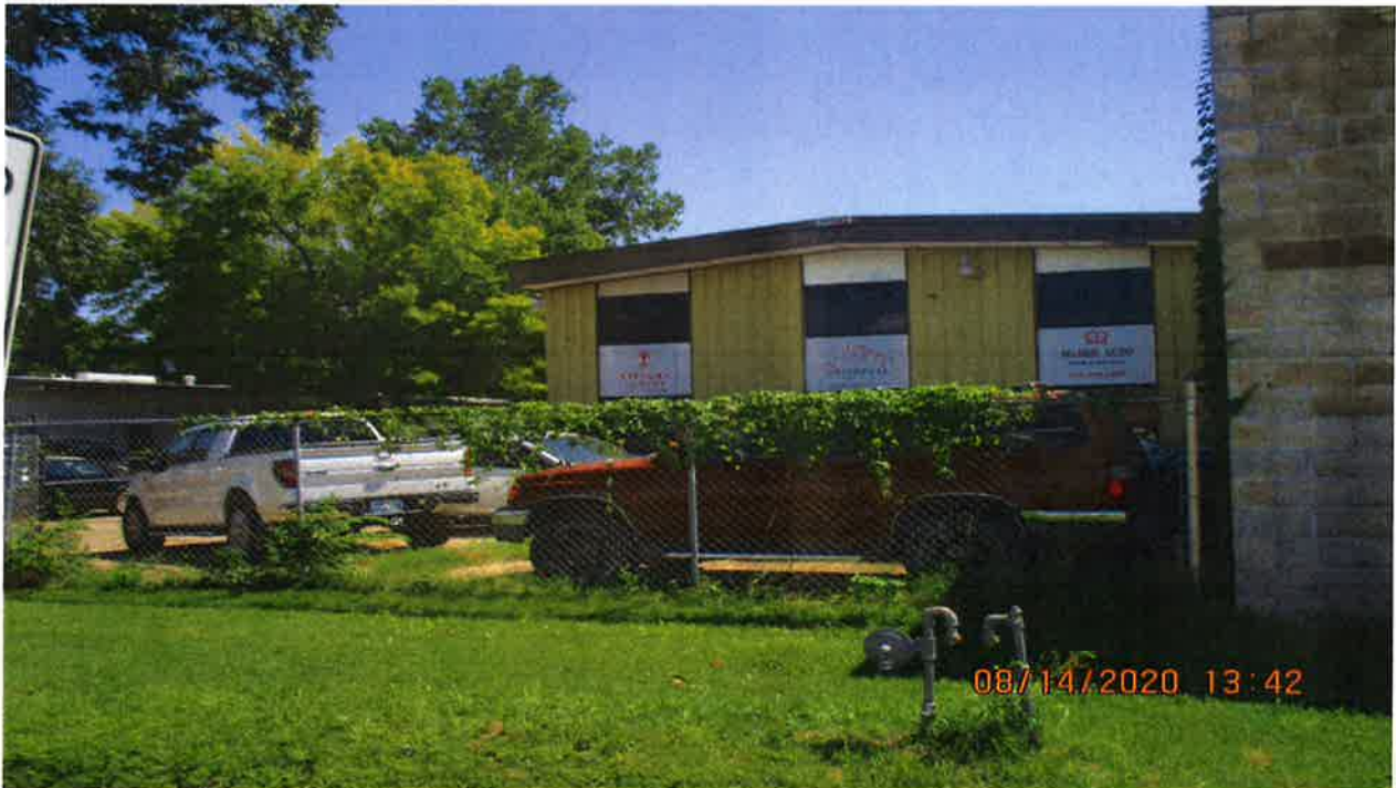
Subject property (1310 E. 58 th St.)