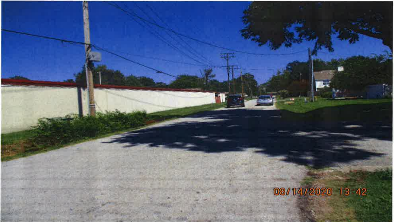
Facing East on 58 th St.