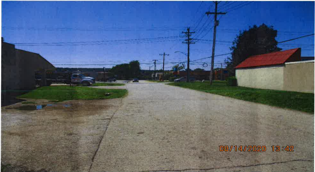
Facing West on 58 th St.