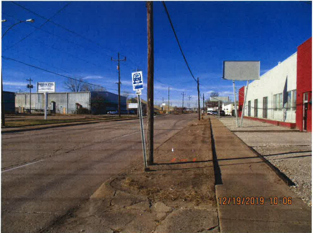
Facing West on Charles Page Boulevard