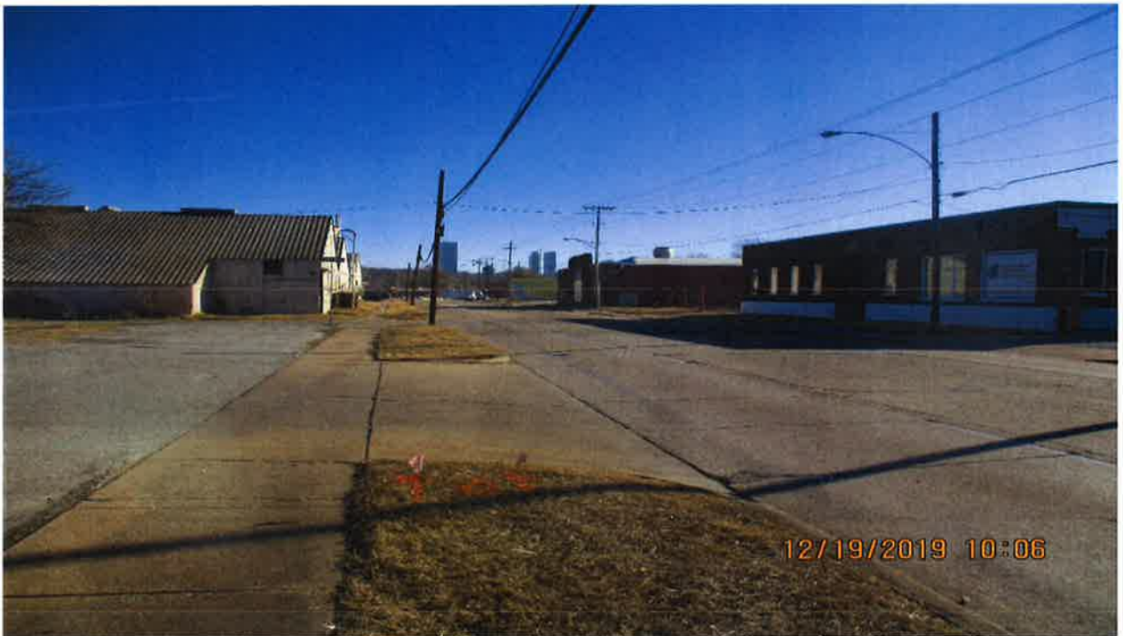
Facing East on Charles Page Boulevard