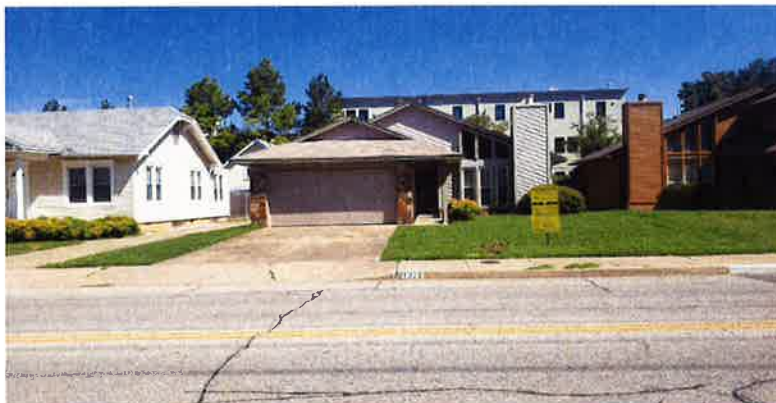
Figure 1. Street view from directly south of the property facing north.

The site is currently made up of three separate parcels, each with a single-family detached home to be demolished and replaced a mixed-use building that includes commercial on the ground floor and apartments up above. Across the street from the subject property to the south are single-family detached homes and the Brookside Church, which was recently re-zoned to MX-1-P-U and had its land use changed from Existing Neighborhood to Main Street in 2019. To the north of the subject property, there is an office space and townhomes, to the west there is a popular commercial strip center which offer a variety of services to the neighborhood, and to the east there are more single-family detached homes.