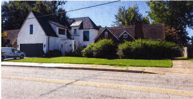
Figure 2. Street view from the front of the property, facing south.