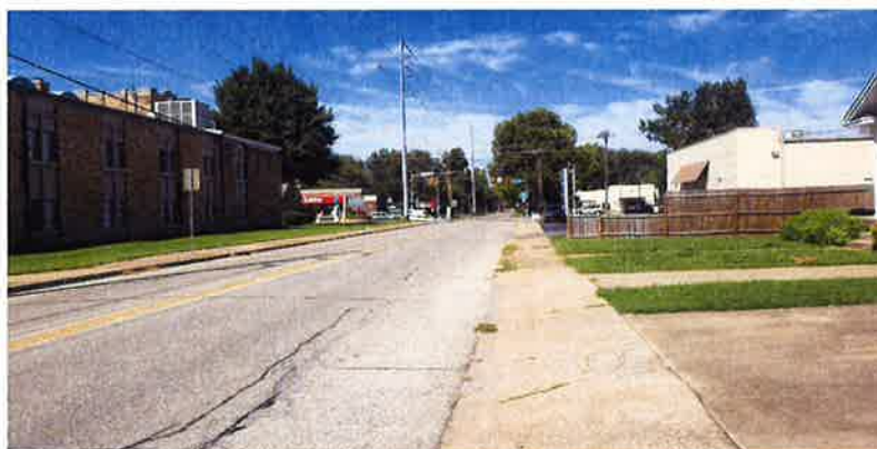
Figure 4. Street view from the front of the property looking west.