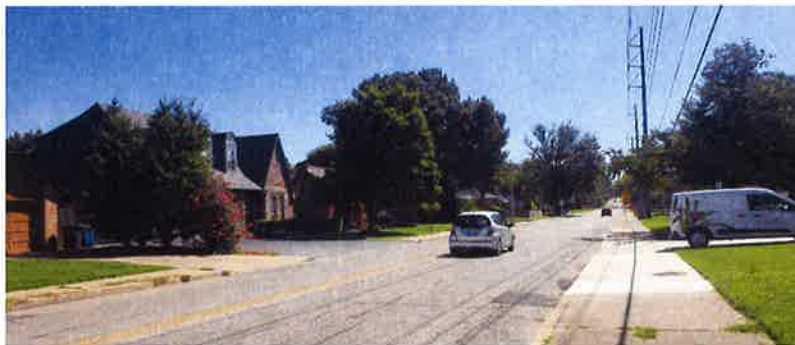
Figure 3. Street view from directly south of the property facing east.