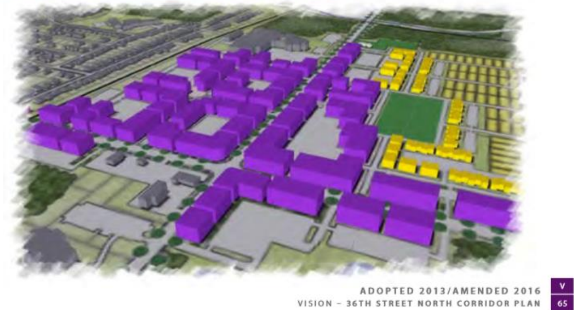
Figure 3.2: Transit-oriented development aspirational building footprint

Special District Considerations: This site is part of the Voluntary MX rezoning program for Peoria Avenue Bus Rapid Transit that was reauthorized by City Council in December 2019. The program expires in December 2021. The subject property is also included in the Healthy Neighborhood Overlay area.