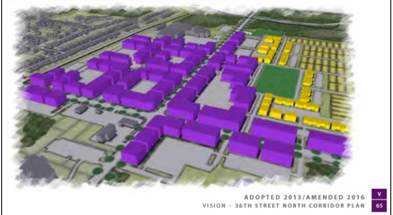
Figure 3.2: Transit-oriented development aspirational building footprint

Special District Considerations: This site is part of the Voluntary MX rezoning program for Peoria Avenue Bus Rapid Transit that was reauthorized by City Council in December 2019. The program expires in December 2021. The subject property is also included in the Healthy Neighborhood Overlay area.