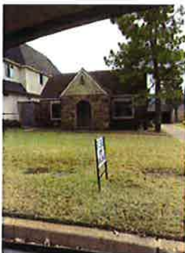
1403/1407 E 35th Street Duplex