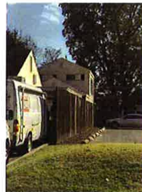
1334 E 34th Street