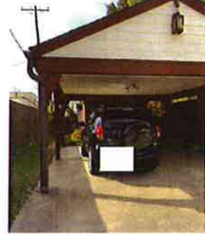
1348 E 35th Street