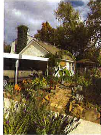
1505 E 35th Street