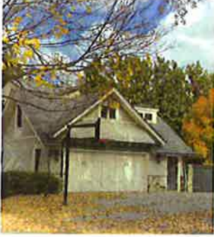
32nd and Victor Ave