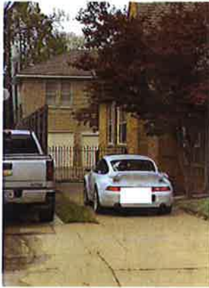
1508 E 35th Street