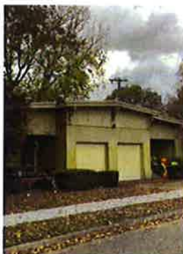
3420 S Rockford Ave Duplex