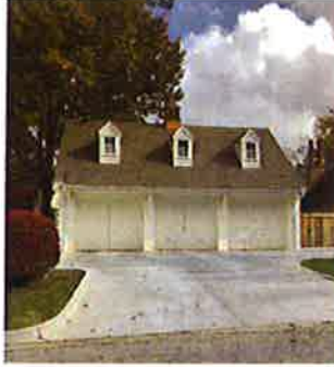
30th and Troost Ave