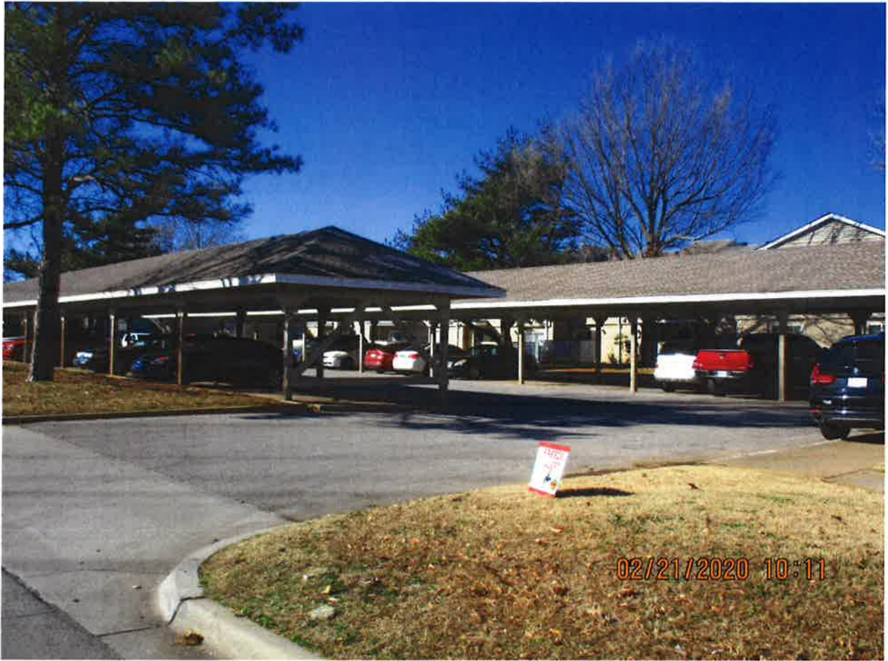
Photo of portion of the existing carports