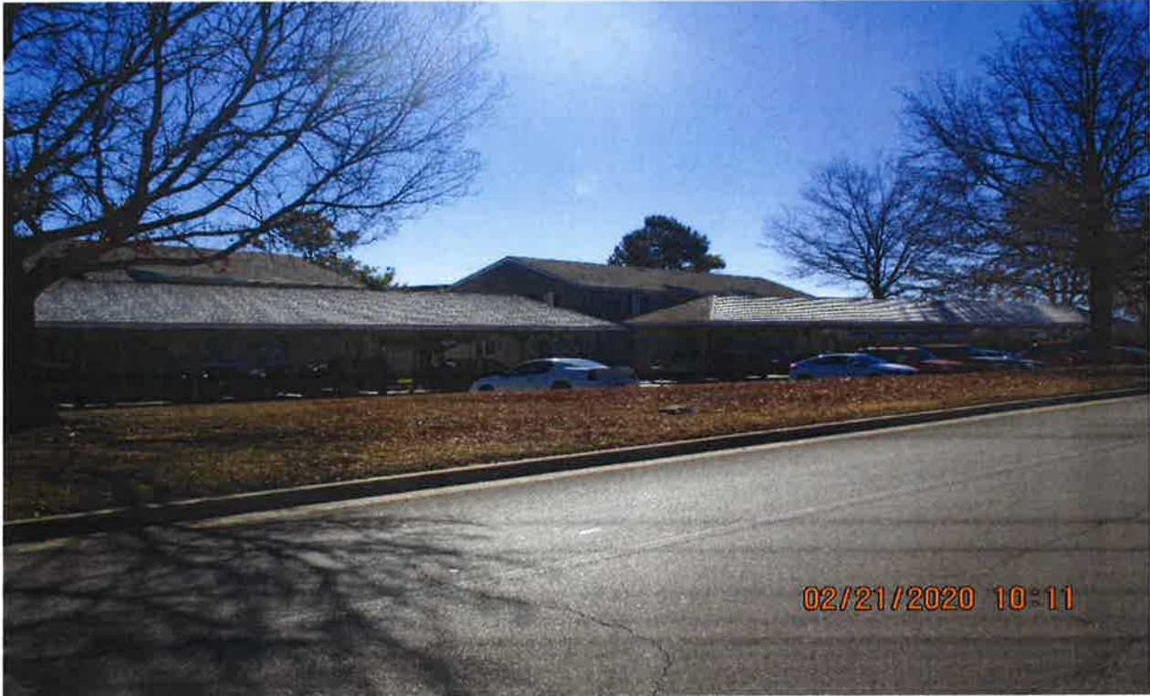
Photo of portion of the existing carports