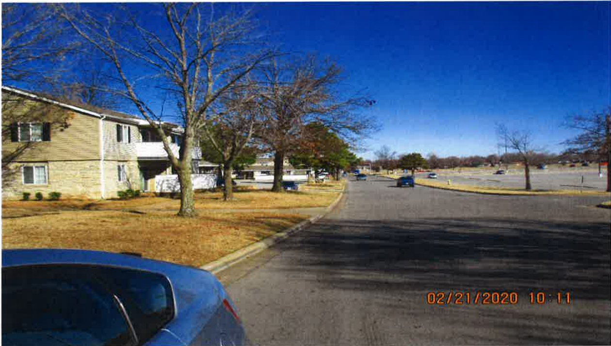
Facing North on 137 th